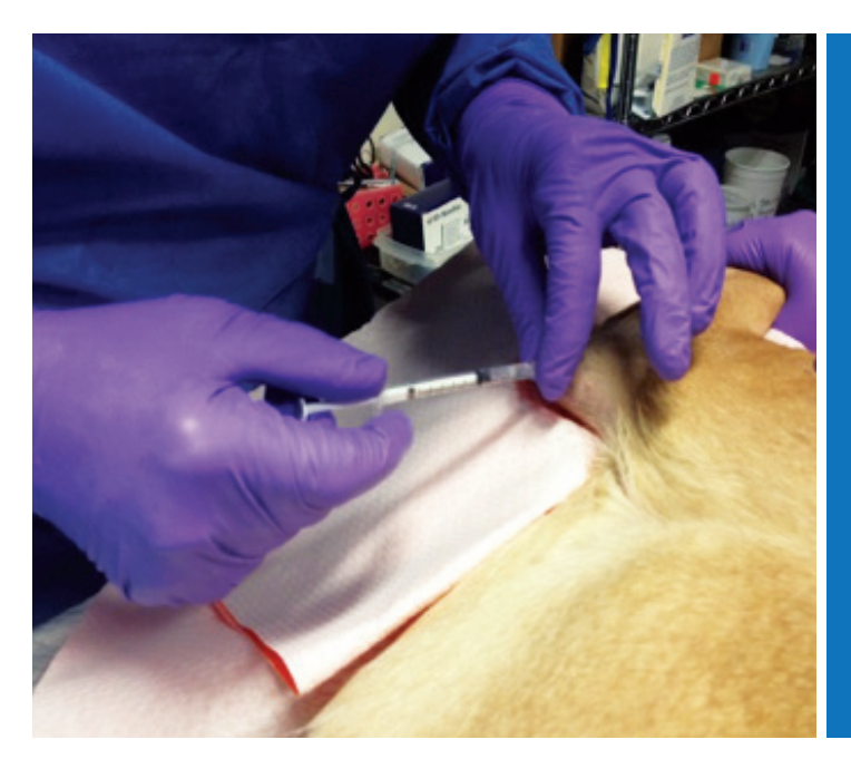
Figure 3. Experimental intra-articular injection of the radionuclide tin-117m into the caudolateral aspect of a canine elbow, positioned at 45-degree flexion, between the lateral condyle of the humerus and the triceps tendon. Following injection the joint is put through a range of motion to disperse the radiocolloid throughout the synovial surface.

Serene, LLC has developed a patented preparation of tin-117m specifically for RSO and other potential applications in veterinary and human medicine. Tin-117m is manufactured using methods that produce yields sufficient to be scaled up for manufacturing therapeutic dosages in commercial quantities.<sup>18</sup> The tin-117m radionuclide is combined with a homogenous colloid.<sup>18</sup> The radionuclide particles are small enough to be phagocytized by synovial macrophages but large enough to avoid leakage outside the joint prior to phagocytosis. In situ retention of the HTC in laboratory animals has been measured out to five t<sub>1/2</sub> (i.e., 68 days), a duration sufficient for therapeutic efficacy. The HTC has demonstrated safety and efficacy following RSO of experimental OA in rats and dogs and safety in normal canine elbow joints ( Figure 3 ).